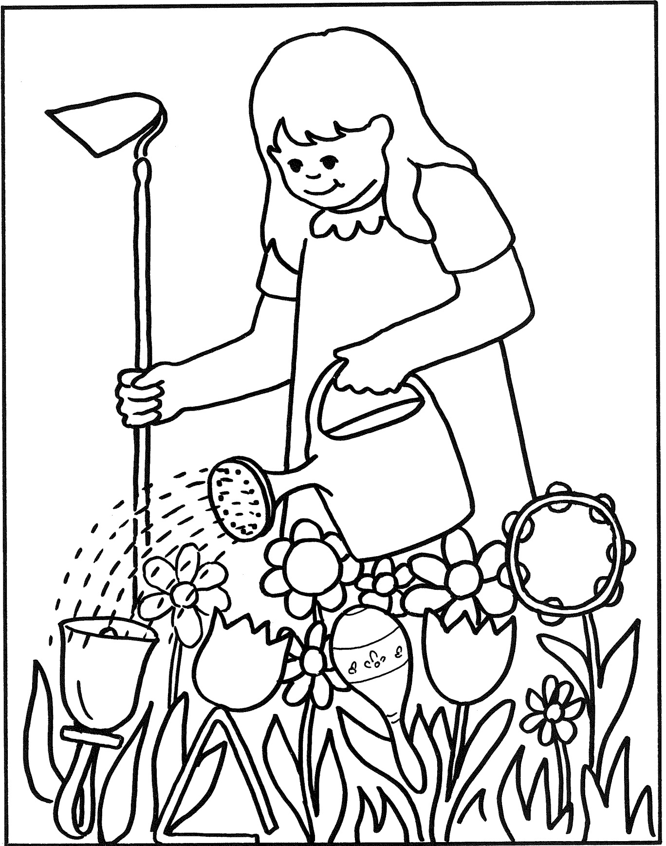
"Mary, Mary, quite contrary, How does your garden grow?" This time, Mary is watering a very funny-looking bunch of flowers. (And what's that she's holding in her right hand?) . . . . .